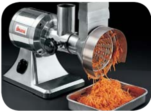
1. Tagliacarote Carrots cutter