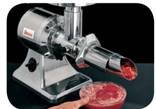
5. Passapomodoro per TC/TCG 22E Tomato sauce making for TC/TCG 22E