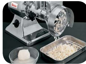
3. Tagliamozzarella Mozzarella cutter