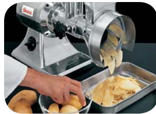
2. Tagliapatate "cips" e funghi Potatoes "cips" cutter