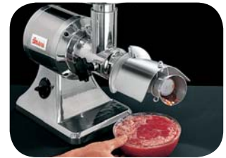
4. Passapomodoro per TC/TCG 12E Tomato sauce making for TC/TCG 12E